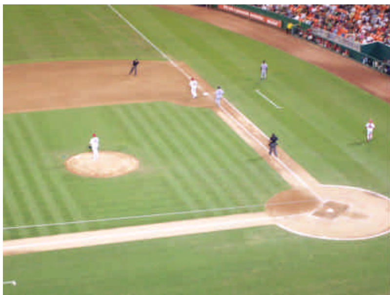
DC After Dark